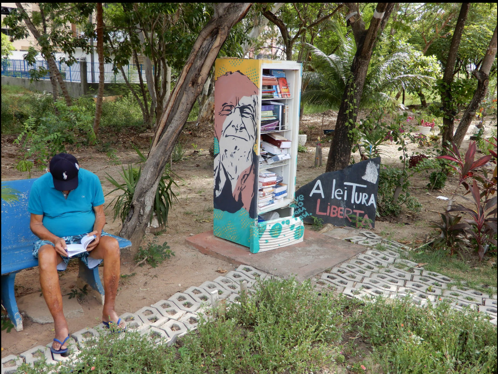
alternative activities – eg library