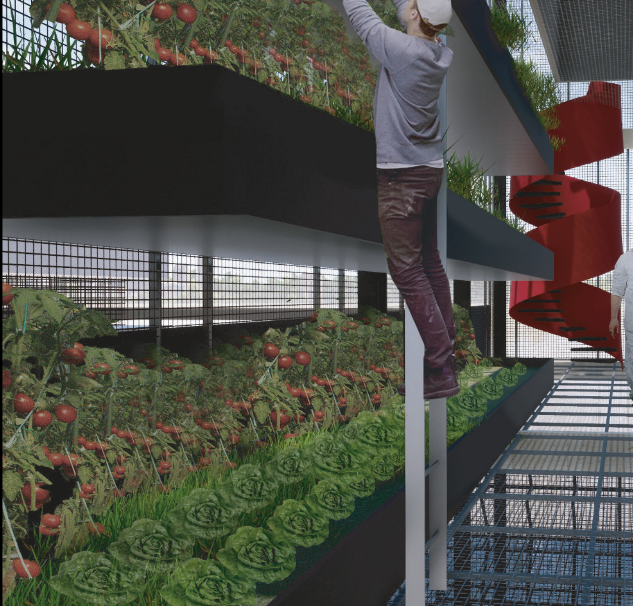
food production on structures