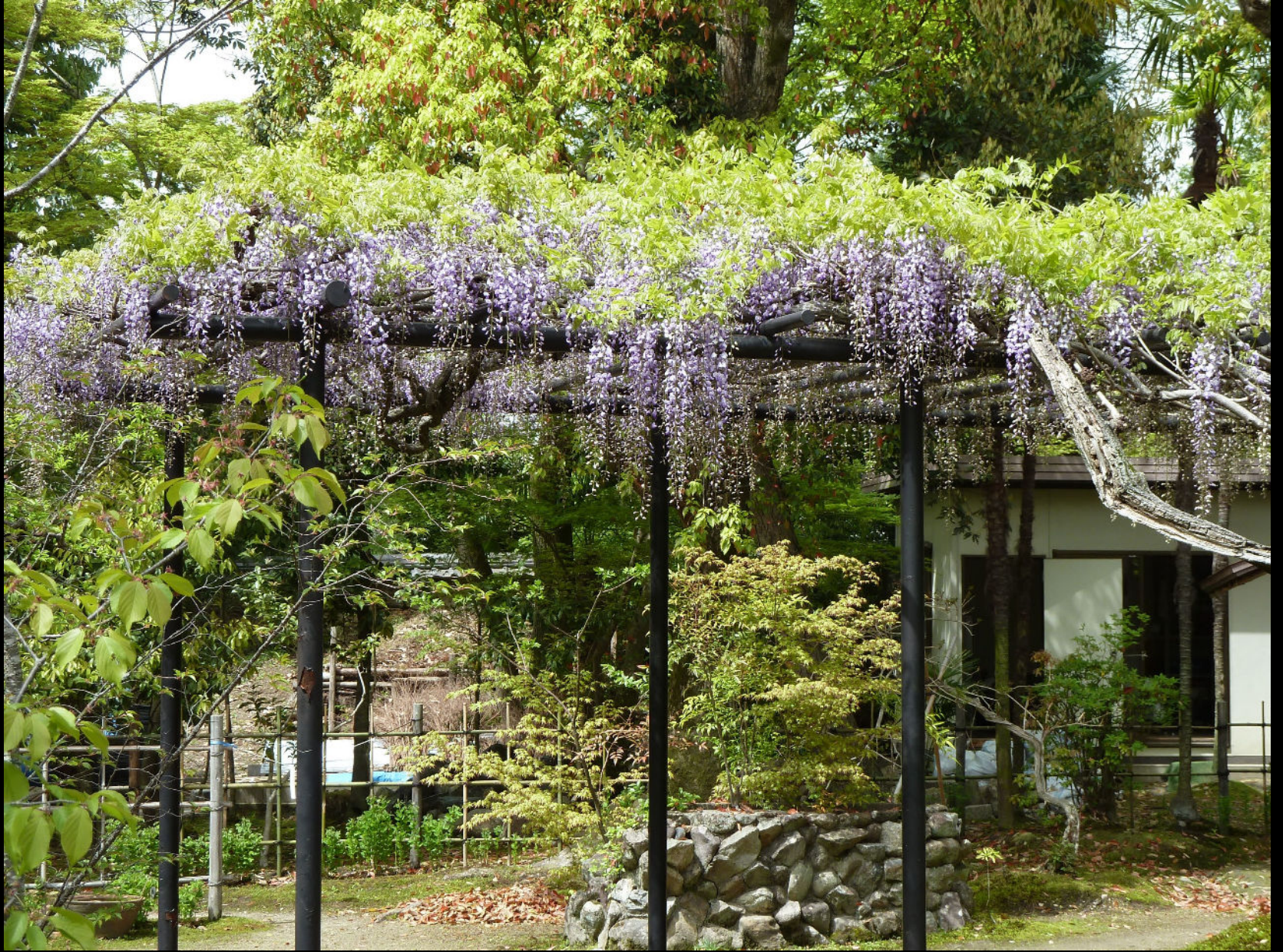
planting on structures