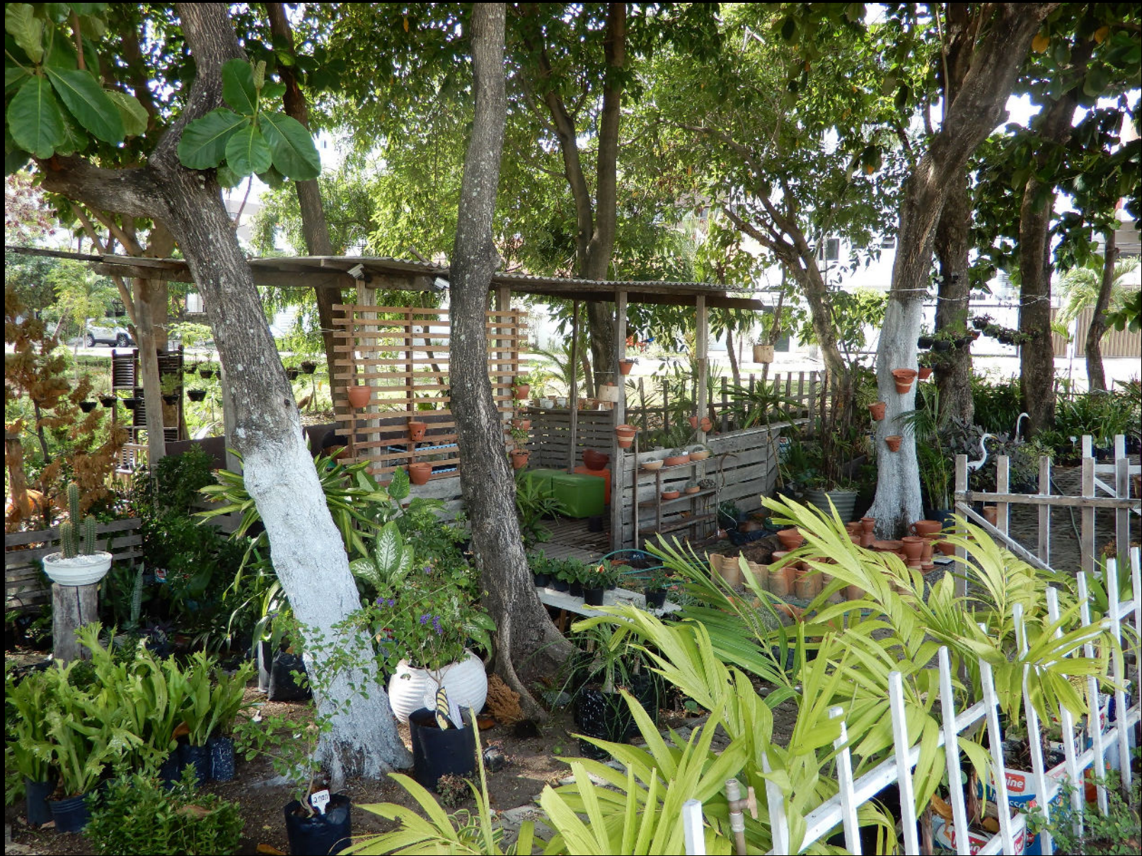
secluded growing areas, with structures